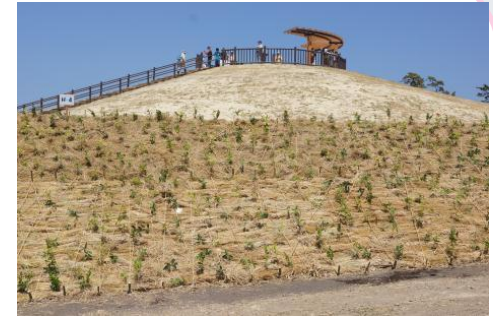
Millennium hope hills project in Iwanuma city, Miyagi prefecture (Completed on June 9, 2013)