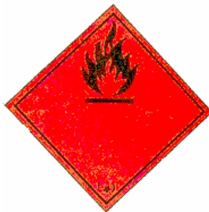
INFLAMMABLE LIQUIDS (WASTE)

Symbol (flame): black or white; Background: red