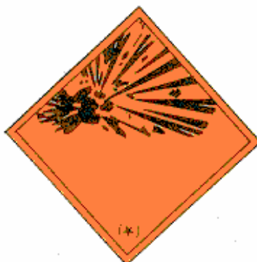
EXPLOSIVE SUBSTANCES (WASTE)

Symbol (exploding bomb): black; Background: light orange