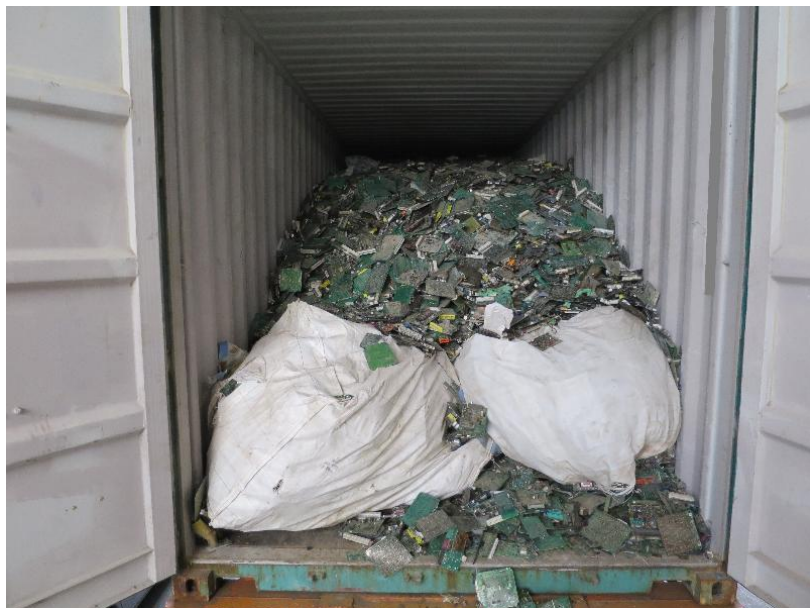
Waste printed circuit boards