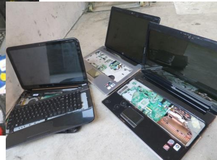
Laptop Computer (flat panel display & battery)