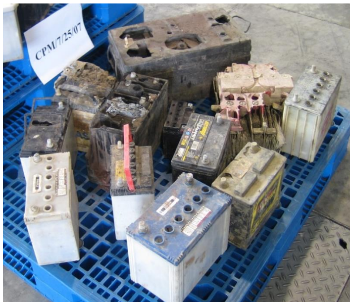
Waste lead acid batteries