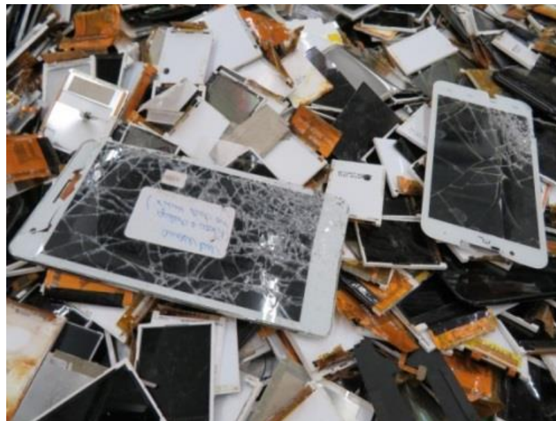
Waste flat panel displays