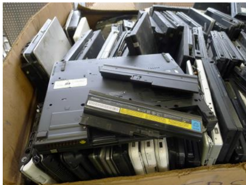
Waste notebook computers with batteries