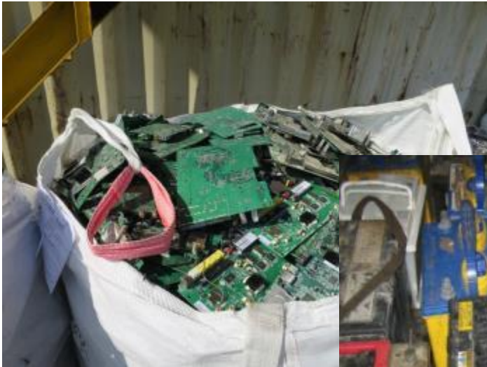
Printed circuit boards