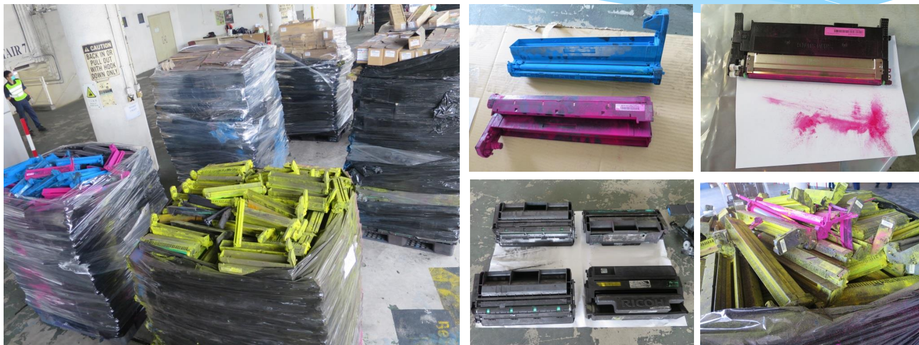
Waste toner cartridge