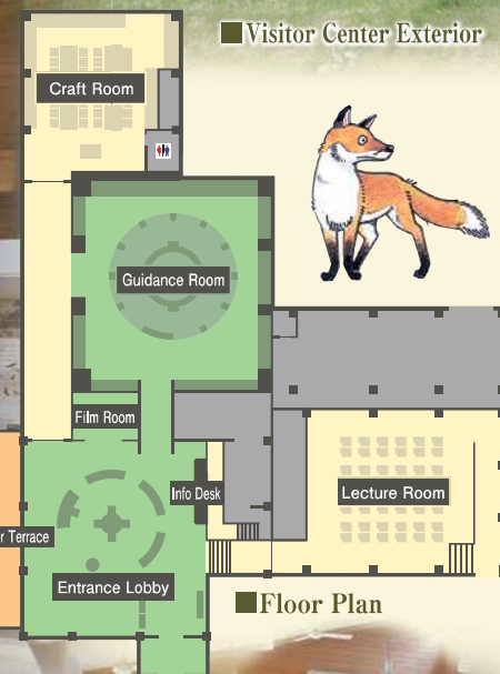
■ Visitor Center Exterior