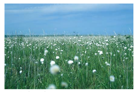
Hare's Tail Cotton Grass

exhibits of the marshland, organizes nature observation programs and conducts wetland research.