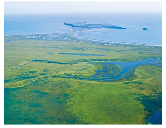
Aerial view of Kiritappu-shitsugen

A variety of ecotourism activities are offered by a local fishery cooperative, tour agencies and NPOs, which attract many visitors from all over the country. The Kiritappu-shitsugen Center is a base for environmental education that displays