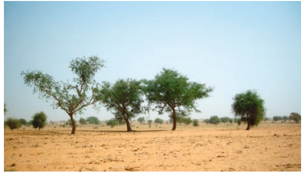
Burkina Faso, Africa

Dryland which are vulnerable to desertification occupy 41% of Earth's land area and are home to more than 2 billion people, at least 90% of whom lives in developing countries. Desertification often causes poverty, food insecurity and water scarcity.