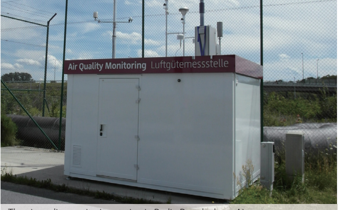
The air quality monitoring station in Berlin Brandenburg Airport This system includes our ambient monitoring analyzer, meteorograph and data logger.

In order to meet the needs for the atmospheric monitoring, we provide additional equipment such as the shelter for the monitoring station and relevant services such as sampling and data processing.