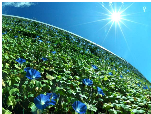
Green Curtain and the Sun

CSR Office, General Affairs, Yamanashi Branch, NTT East (Yamanashi Prefecture)