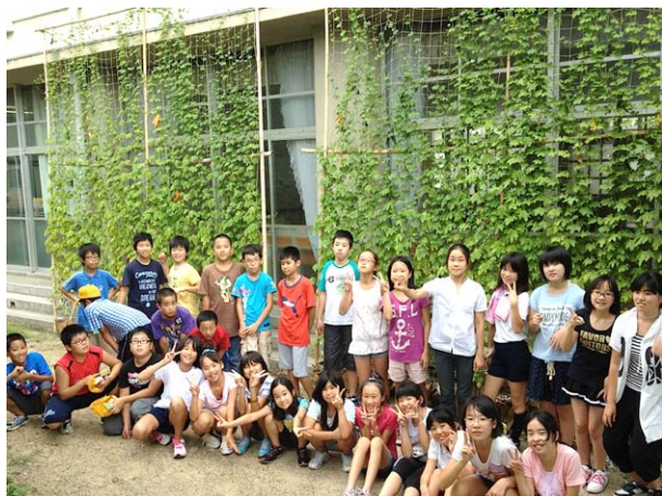
Goya (bitter gourd) Curtain with Bamboo and Hemp – Connecting People and the Community

PTA, Koyo Elementary School in Muko City (Kyoto Prefecture)