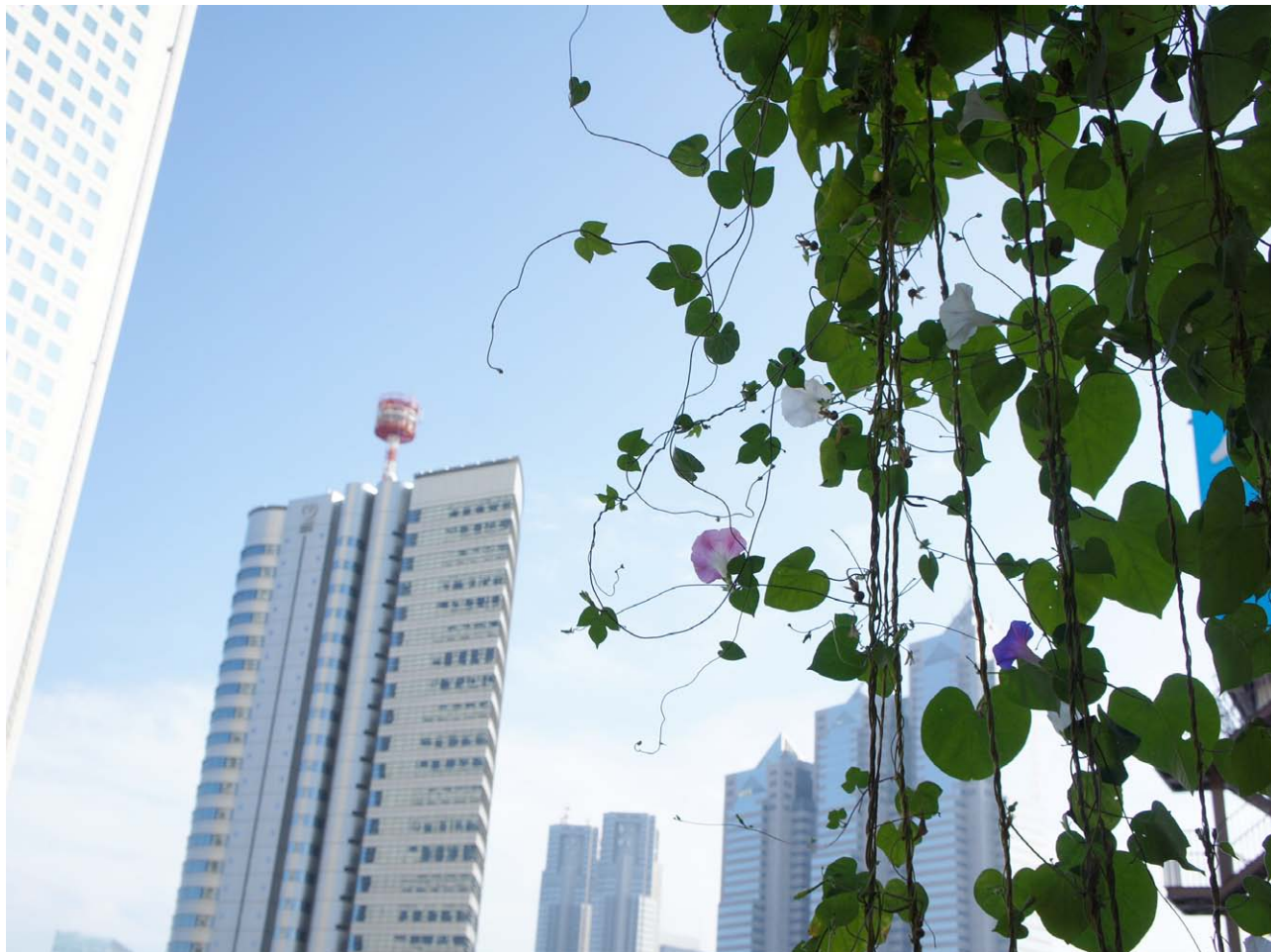
Title Swaying Morning Glory with Skyscrapers Name Mieko Matsubara (Tokyo Prefecture)