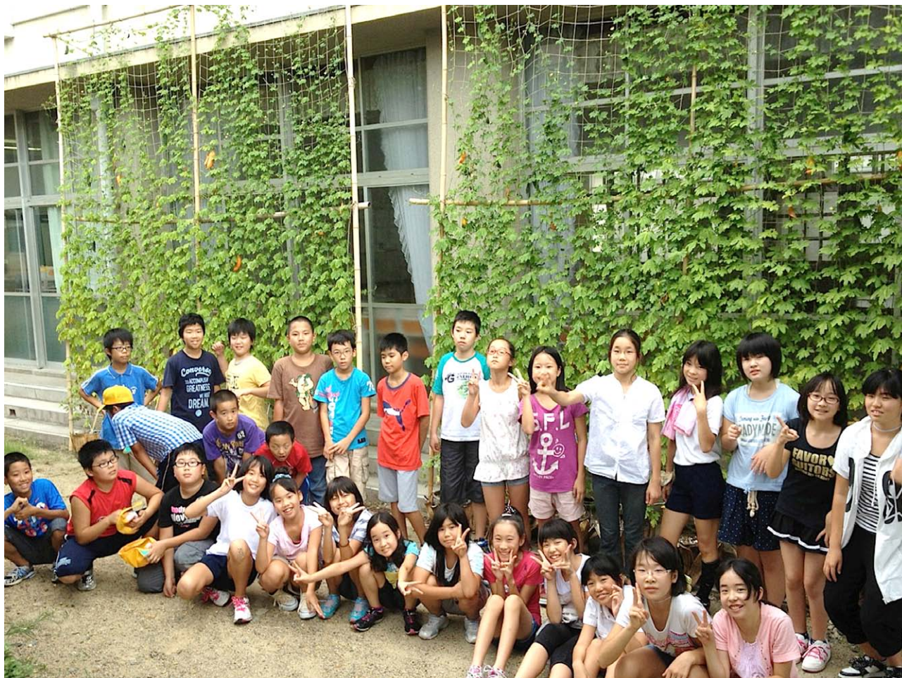
Title Goya Curtain with Bamboo and Hemp – Connecting People and the Community Name PTA, Koyo Elementary School in Muko City (Kyoto Prefecture)