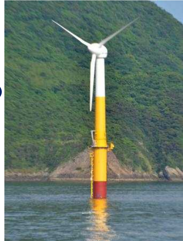
Offshore Wind Turbine installed by MOEJ

Required to study noise from offshore wind turbines as well