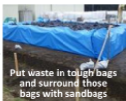
Put waste in tough bags and surround those bags with sandbags