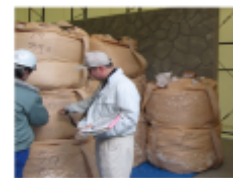
Staff of the Regional Environmental Office checking the storage status

Prepared based on the website, "Information on Disposal of Radioactive Waste," of the Ministry of the Environment