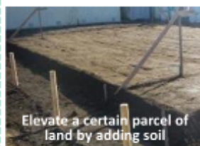
Elevate a certain parcel of land by adding soil