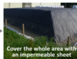
Cover the whole area with an impermeable sheet