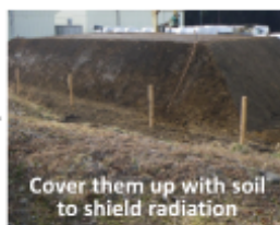
Cover them up with soil to shield radiation