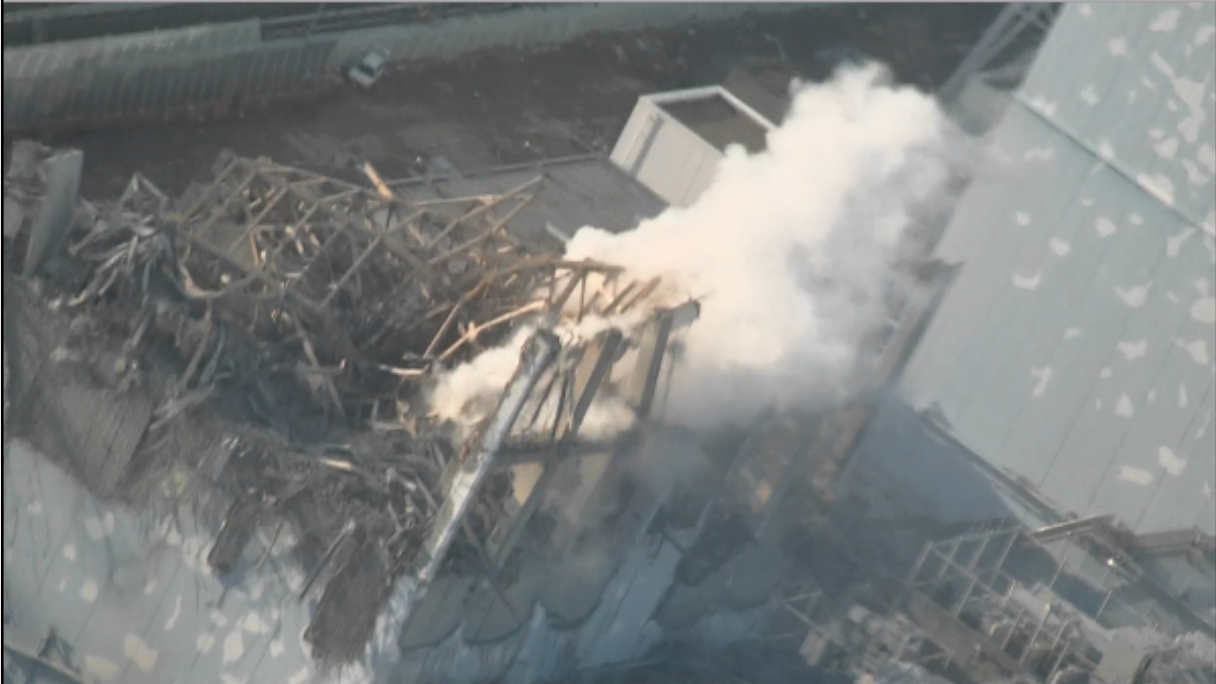
Tokyo Electric Power Company (TEPCO)'s Fukushima Daiichi NPS Unit 3 (shot from the air)

(Shot on March 16, 2011)