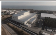
Temporary Incineration Facility in Okuma Town (December 2017)

Disaster waste has been disposed of based on the Treatment Plan on Waste within the Management Areas (partial revision on December 25, 2013).