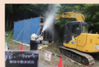
Demolition of a damaged house, etc.

*Tamura City and Kawamata Town use existing waste disposal facilities for disposing of disaster waste. *Futaba Town has two Temporary Incineration Facilities.