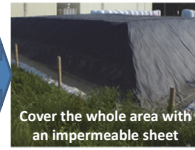
Cover the whole area with an impermeable sheet