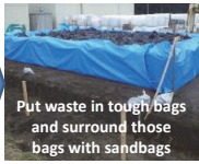
Put waste in tough bags and surround those bags with sandbags