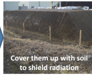
Cover them up with soil to shield radiation