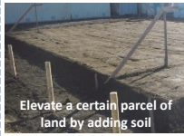
Elevate a certain parcel of land by adding soil