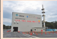
Temporary Incineration Facility in Naraha Town (Oct. 2016)

* Tamura City and Kawamata Town use existing waste disposal facilities for disposing of disaster waste.