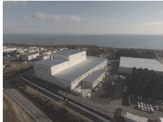
Temporary Incineration Facility in Okuma Town (December 2017)

As of April 1, 2017 Contaminated Waste Management Areas Habitation Restricted Areas Temporary Incineration Facilities (including planned facilities and those already demolished, etc.) Preparation Areas for Lift of Evacuation Order Areas where Returning is Difficult