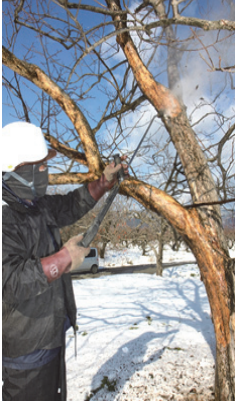
High-pressure washing of a persimmon tree