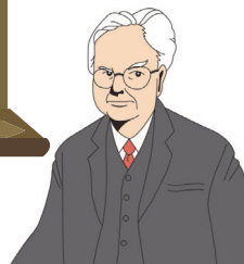
Rolf Sievert (1896-1966)

Founder of the physics laboratory at Sweden's Radiumhemmet Participated in the foundation of the International Commission on Radiological Protection