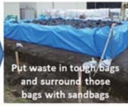
Put waste in tough bags and surround those bags with sandbags