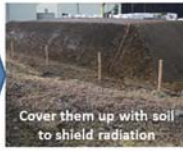
Cover them up with soil to shield radiation