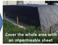
Cover the whole area with an impermeable sheet