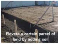
Elevate a certain parcel of land by adding soil