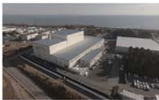
Temporary Incineration Facility in Okuma Town (December 2017)

Disaster waste has been disposed of based on the Treatment Plan on Waste within the Management Areas (partial revision on December 26, 2013).