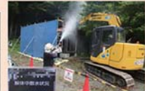
Demolition of a damaged house, etc.