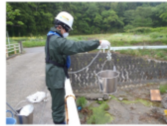
(River: water sampling)

[Frequencies] Twice to 10 times a year depending on the contamination status, etc.