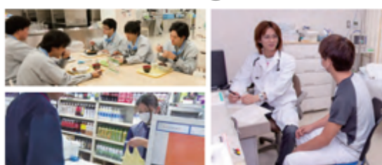
The large rest house has a dining room and a convenience store.