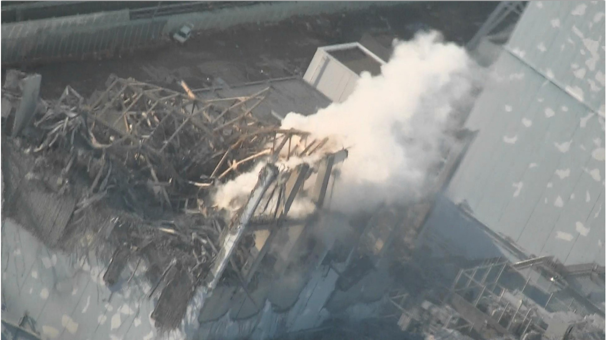
Tokyo Electric Power Company (TEPCO)'s Fukushima Daiichi NPS Unit 3 (shot from the air)

(Shot on March 16, 2011; Provided by TEPCO)