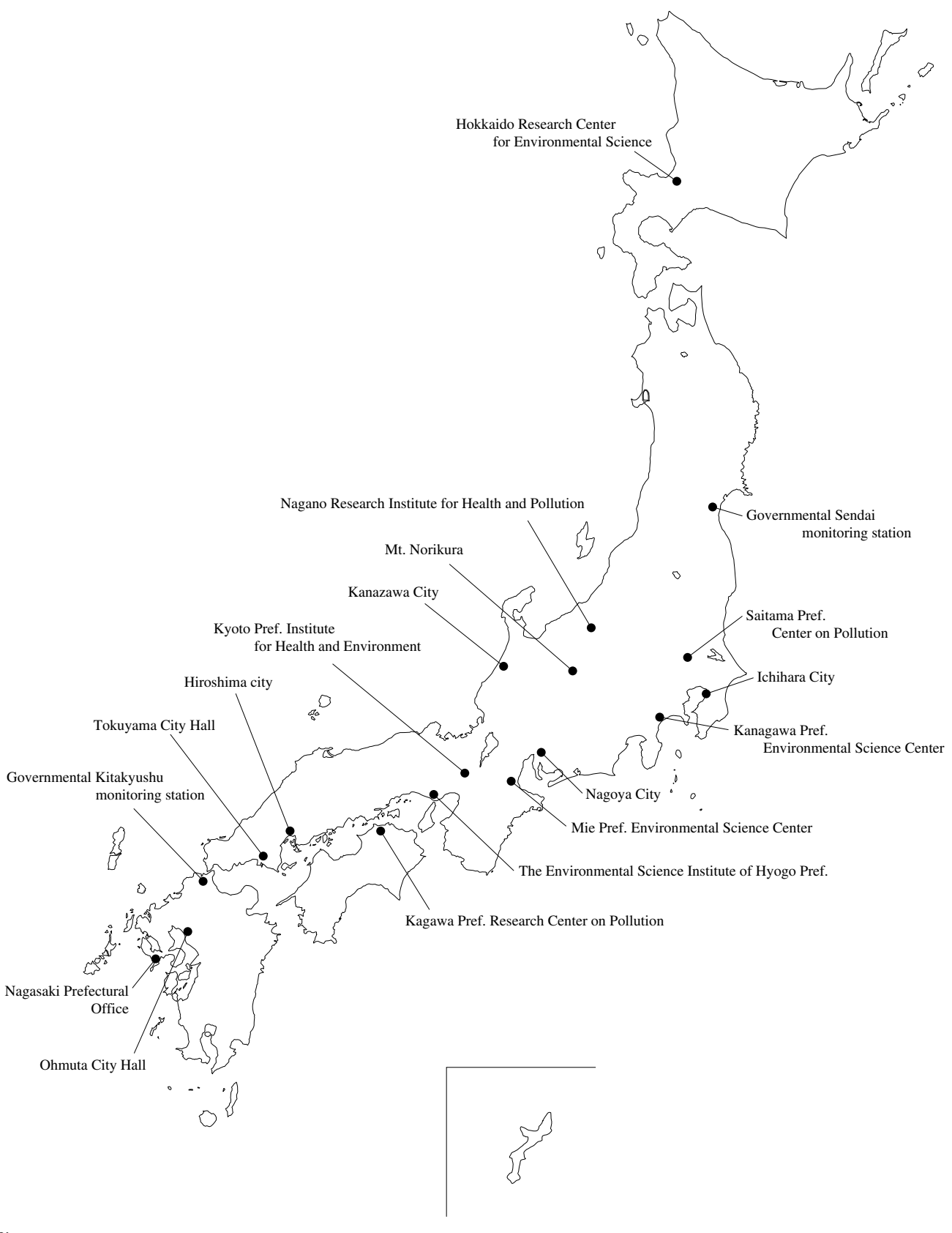
Fig. 3-2 Locations of the General Inspection Survey of Chemical Substances on Environmental Safety (Air)

The survey in F.Y. 2000 was conducted on 14 substances from 22 sampling locations.