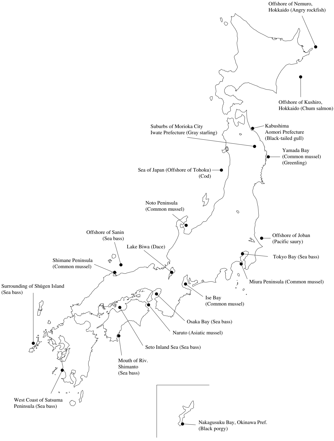
Fig. 3-4 Sampling sites of the Wildlife Monitoring

The survey has 20 sampling sites (i.e. 17 from sea areas, 1 from fresh water, and 2 from land), and a total 12 species of wildlife (i.e. 8 fish (e.g. sea bass), 2 shellfish (e.g. common mussel) and 2 birds) were selected in a F.Y.2000 survey.