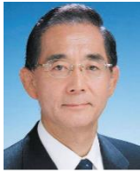
Yoshiaki Harada Minister of the Environment