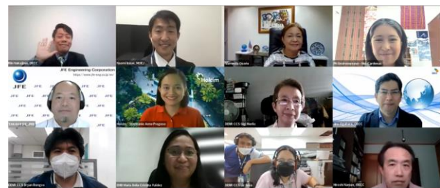
Participants from the WS1 held in January 2022

The second workshop was titled as "PaSTI Public-Private Sector Dialogue on MRV", where panelists with knowledge on MRV system were invited from the waste sector and other private sectors in the Philippines. They actively exchanged opinions and needs on how to organize the public-private cooperation with a view to future efforts to establish a system that ensures incentives for MRV.