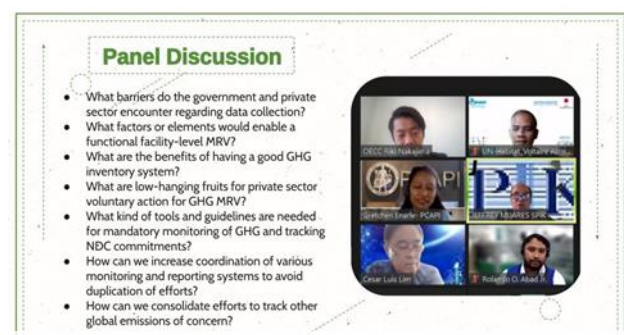
Panel Discussion at the PaSTI Public Private Sector Dialogue

To see the video recordings of both seminars please visit our official PaSTI YouTube Channel: