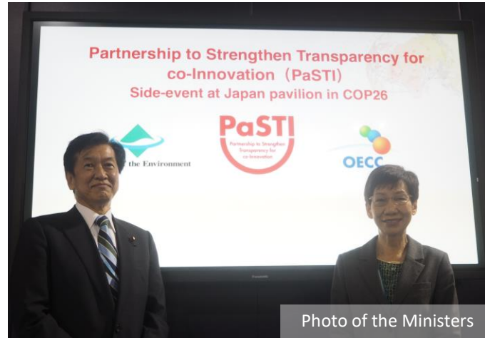
Photo of the Ministers

Aiming at discussing the development of common guidelines for the region and the involvement of private companies in order to strengthen transparency in the ASEAN region, representatives from various sectors were invited for keynote speeches and the panel discussion. ( More information on the seminar is on the backside of the newsletter. )