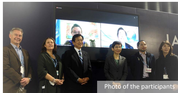
Photo of the participants

The seminar video is available on PaSTI YouTube Channel: https://www.youtube.com/channel/UCD5Q6gOXdUrMqXj09Hd42Zw