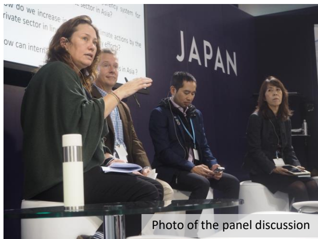
Photo of the panel discussion

In the panel discussion, the transparency scale-up was discussed by four panellists from international organizations and private sectors. They expressed their opinions on the ideal form of reporting requirements and the incentive introduction from each perspective, based on three guiding questions;