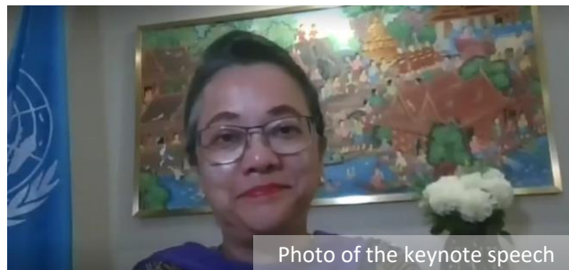
Photo of the keynote speech