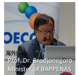
Prof. Dr. Brodjonegoro Minister of BAPPENAS

The event introduced the on-going PaSTI-Indonesia project and announced future cooperation with AWGCC. Mr. Harada, Minister of the Environment, Japan, expressed his expectation that PaSTI would serve as good opportunities to promote discussion on the cooperation between the governments and the private sector, to create a co-innovation in partner countries that would lead to the benefits and challenges in transparency enhancement as a part of climate change measures.