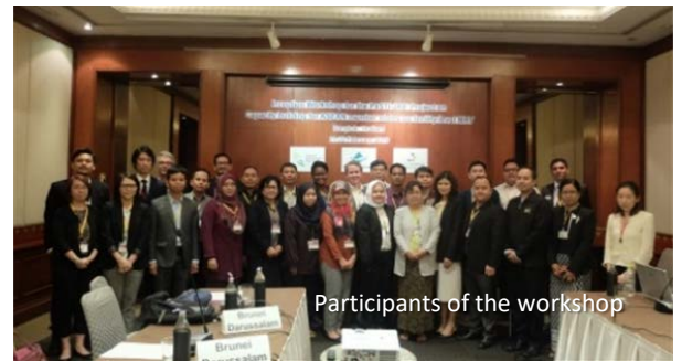
Participants of the workshop

The project has already been endorsed by the AMS and its implementation is about to begin.