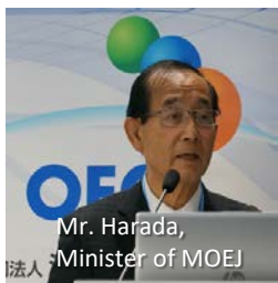
Mr. Harada, Minister of MOEJ

The event introduced the on-going PaSTI-Indonesia project and announced future cooperation with AWGCC. Mr. Harada, Minister of the Environment, Japan, expressed his expectation that PaSTI would serve as good opportunities to promote discussion on the cooperation between the governments and the private sector, to create a co-innovation in partner countries that would lead to the benefits and challenges in transparency enhancement as a part of climate change measures.