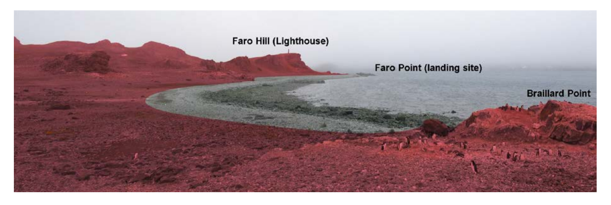
View to the site from South of Braillard Point, eastern area of the Northeast beach in Ardley Peninsula (Ardley Island). Entry into the ASPA (red area) is prohibited without a permit.