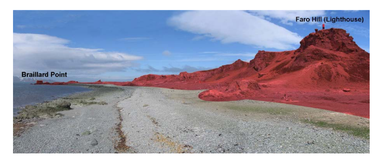
View to the site from Faro Point, the landing point to visit this site. Entry into the ASPA (red area) is prohibited without a permit