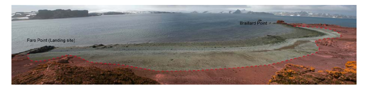
View to the site from Faro Hill. Entry into the ASPA (red area) is prohibited without a permit.