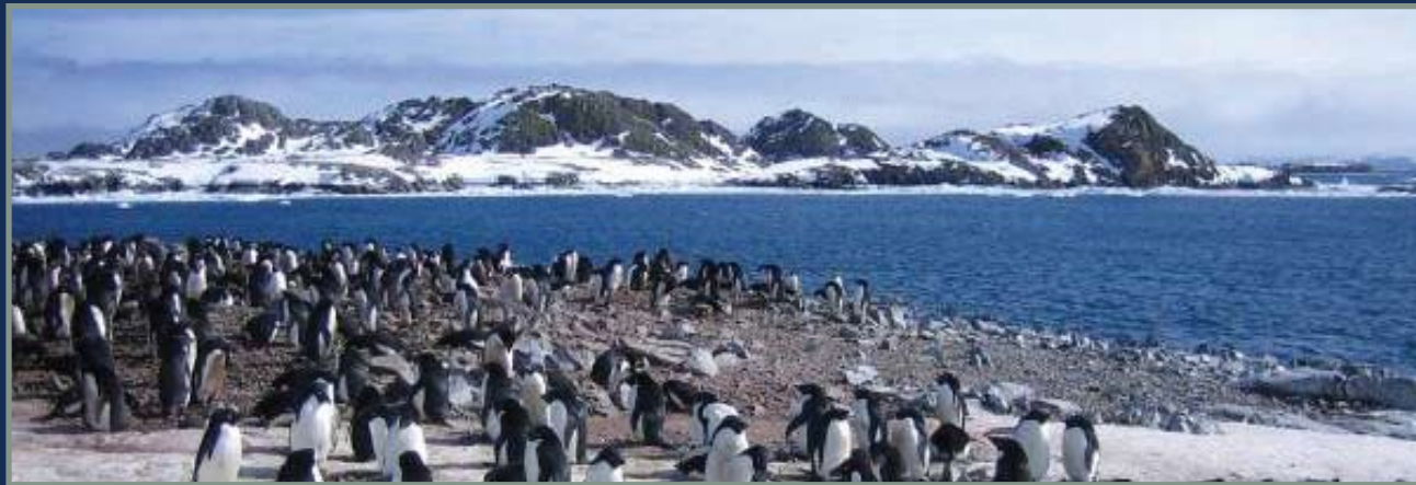
Torgersen Island Adélie penguin colony (D. Patterson-Fraser, 2008)