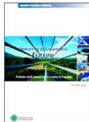
Powering a Sustainable Future