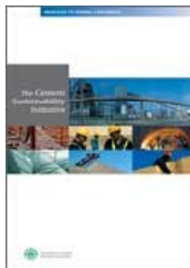
The Cement Sustainability Initiative