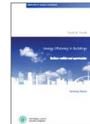
Energy Efficiency in Buildings

G8 Environment Ministers Meeting "Dialogue with Stakeholders" Kobe, May 24, 2008