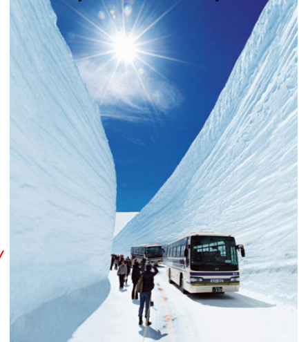
Photo: Tateyama - Giant Snow Walls