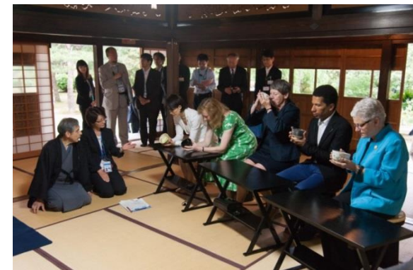
Special treats by Toyama Prefectural Tea Ceremony Association

Toyama Prefectural Tea Ceremony Association performed the tea ceremony at Uchiyama Tei, Registered tangible cultural property. Participants enjoyed this Japanese cultural experience and interaction with the local residents.