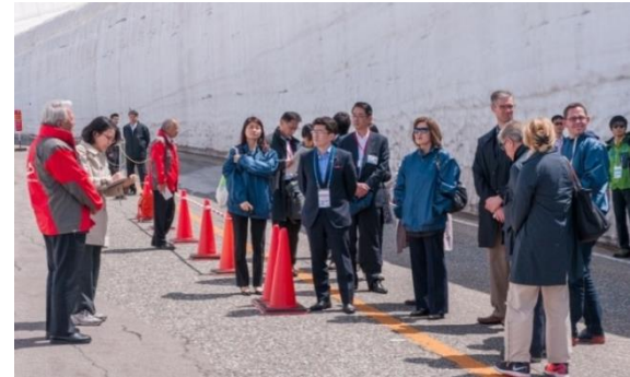
"Yuki-no-Otani" Snow Wall Walk