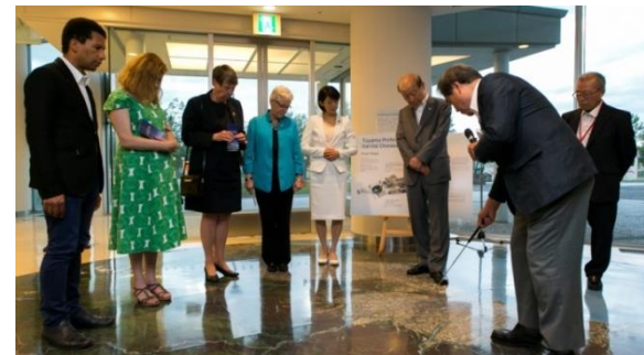
Visit to the Itai-itai Disease Museum

Ms. Tamayo Marukawa, Minister of the Environment, Japan accompanied the participants on the excursion to the Itai-itai Disease Museum.