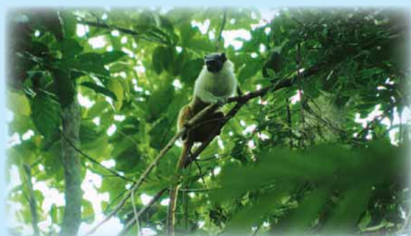
The endangered Pied Tamarin ( Saguinus bicolor ) (Brazil)

Forest can change the world - Initiative for Improvement of Forest Governance will contribute to global tropical forest and biodiversity conservation and climate change mitigation by using Japan's advanced satellite technology and multi-stakeholder partnerships