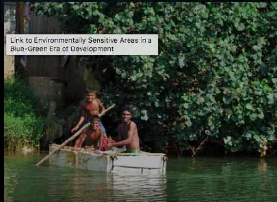
Link to Environmentally Sensitive Areas in a Blue-Green Era of Development