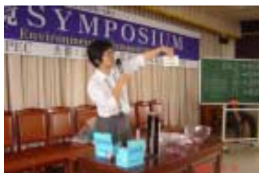
Demonstration by the Japanese instructor