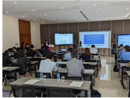
Workshop to Promote Decarbonization