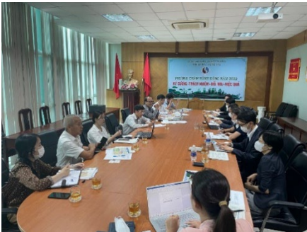
Meeting with Department of Natural Resources and Environment of Ba Ria – Vung Tau Province