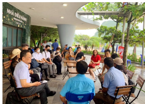
Visit to jokaso test operation site (local press photo)