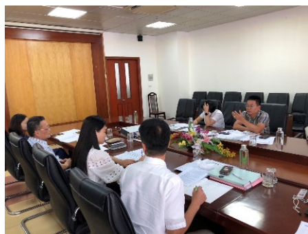
Meeting with Quang Ninh Province