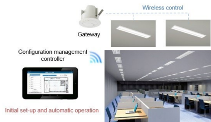
JCM Model Project adopted (Introduction of LED lighting with dimming)