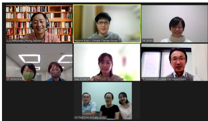
Online Meeting between Ho Chi Minh City and Osaka City