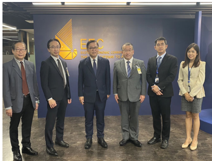
Policy Dialogue between EEC and Osaka City