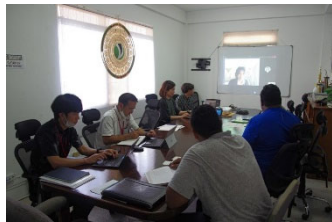
▲ Meetings with electric power providers