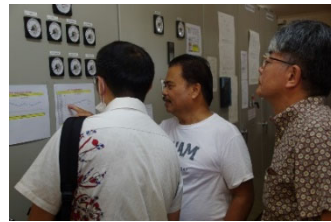
▲ Survey of Power Plants