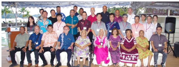
▶ Participation in the Okinawa-Palau Friendship Mission