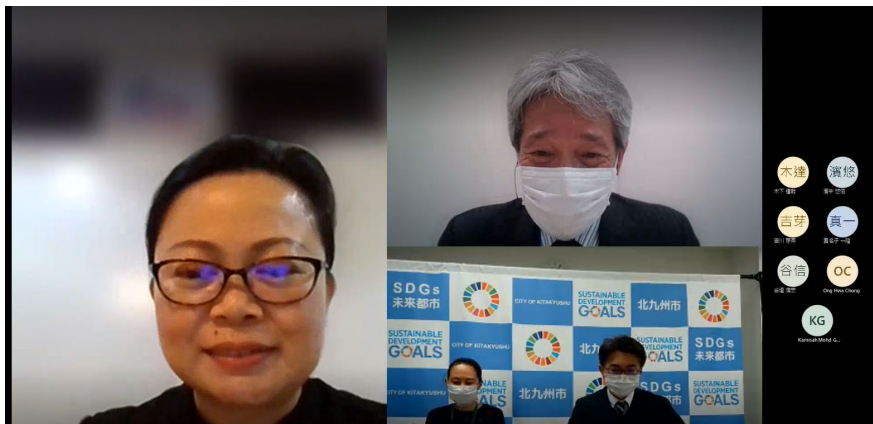
▲ Meeting with IRDA