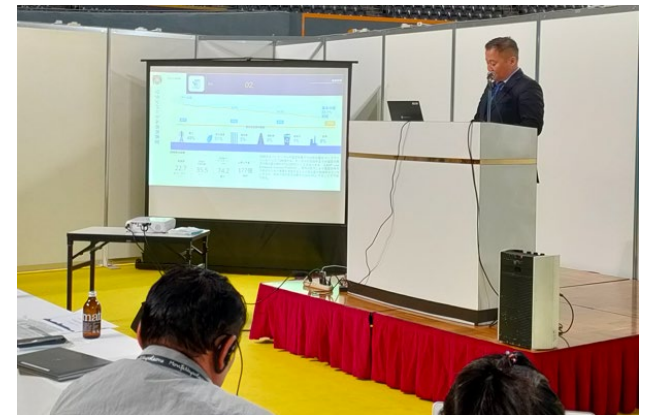
Mongol seminar at Kankyo Hiroba Hokkaido 2023