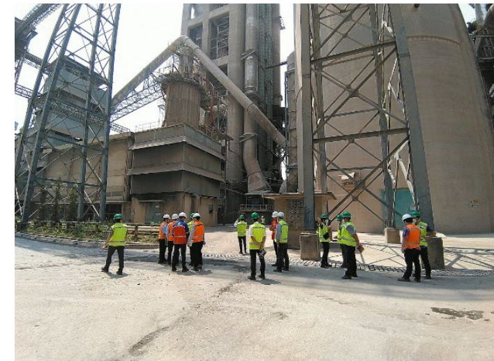
Site visits in the cement plant