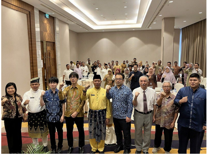
C3P Workshop in PKU