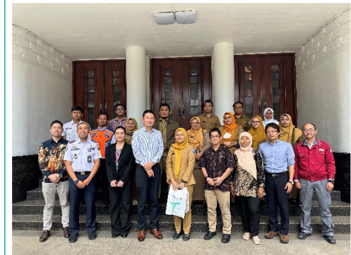
Group photo in Bandung City Hall