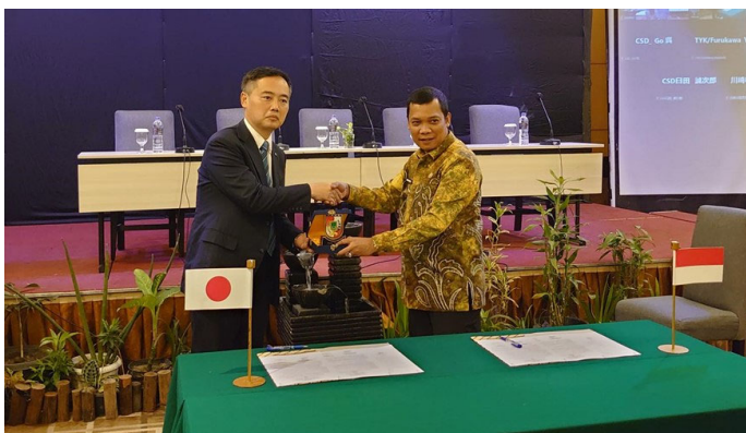
LOI Signing Ceremony (Feb. 2022)