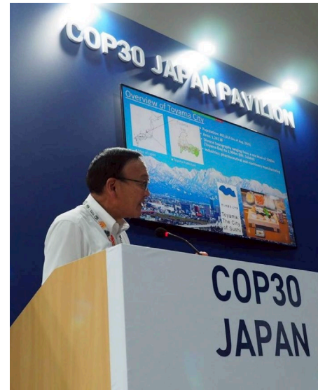
Mayor Fujii, Toyama City