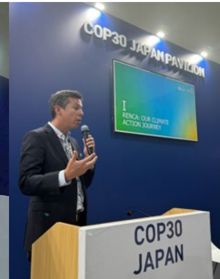
Mayor Castro, Renca, Chile