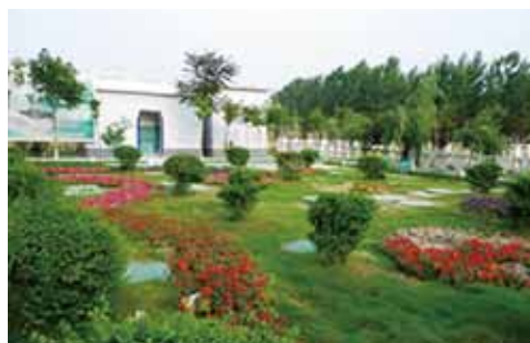
Model facility in Zhaojia new village, Taizhou city