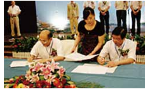
Handover Ceremony at Jiangsu, Taizhou

As a result of monitoring implemented in some of six project areas where construction was completed, the goals for water quality level and maintenance costs were mostly achieved. The local government of Taizhou, Jiangsu, one of the model project areas, decided to construct ten more facilities based on the outcomes with support from the Ministry of Environmental Protection of the People's Republic of China.