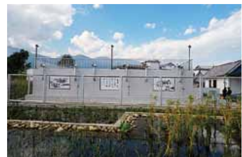
Wastewater treatment plant in Dali city, Yunnan Province