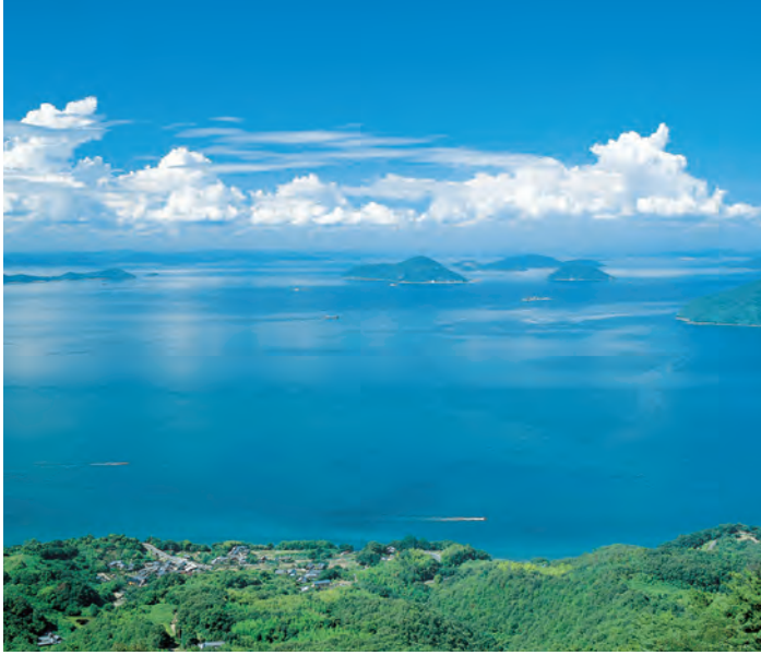
The summer of the archipelagic sea (Setonaikai NP) (3)