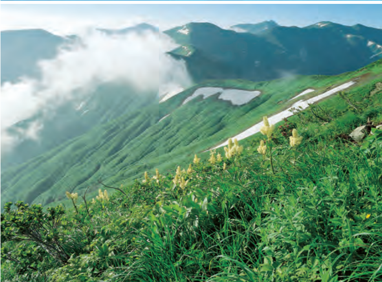
A flower garden on a major ridge of Asahi Mountain Range (Bandai-Asahi NP) (6)