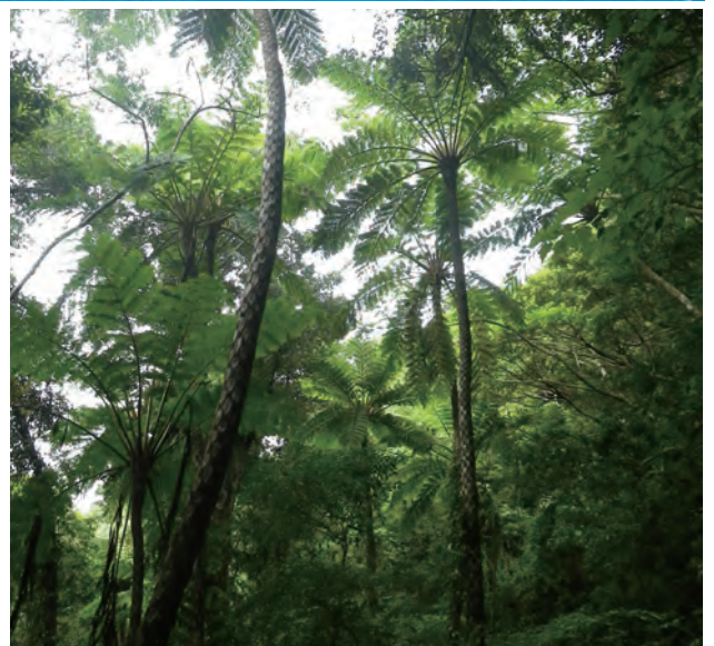
Kinsakubaru of Amami Oshima Island (Amamigunto National Park)