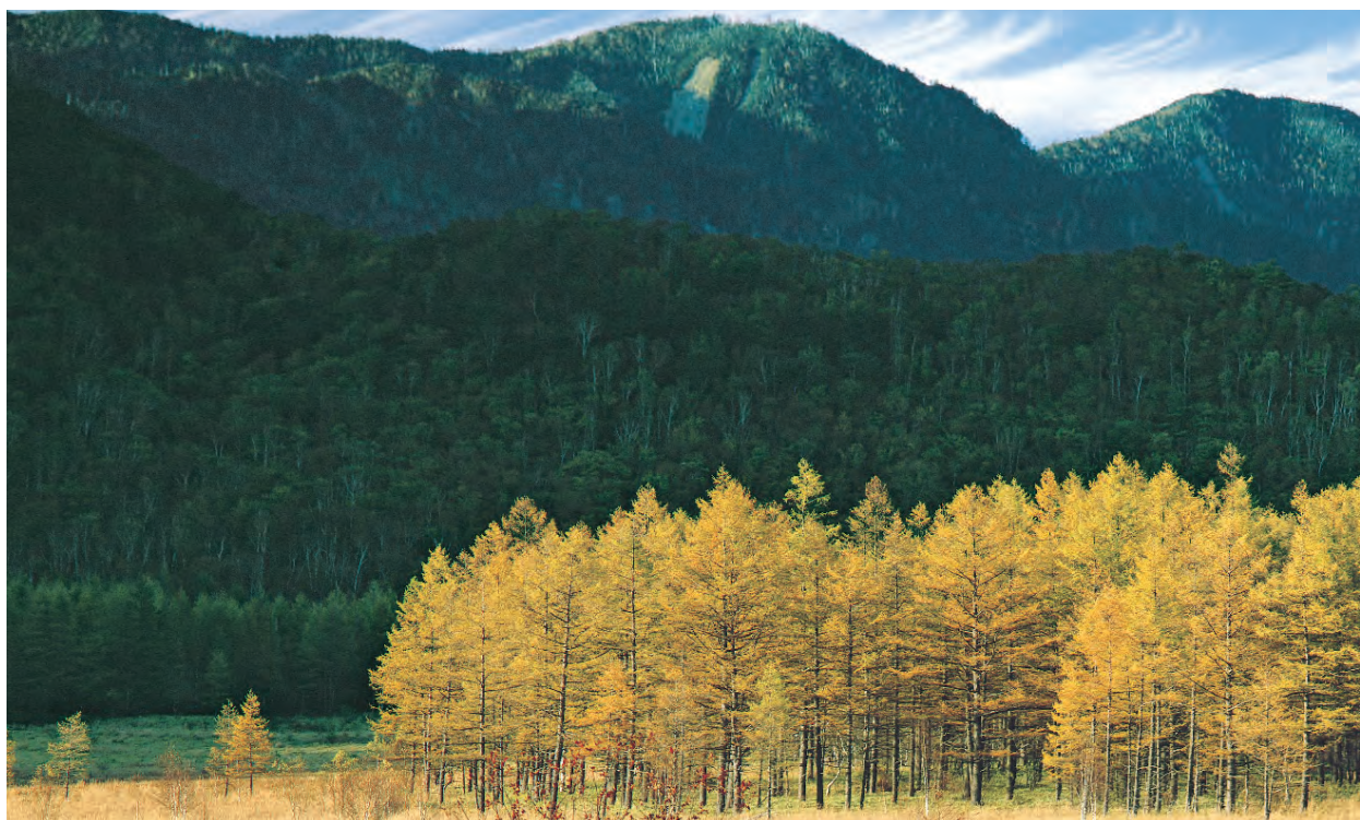
Kusa-momiji (Grass autumn color) and Japanese larch trees (Nikko NP) (3)