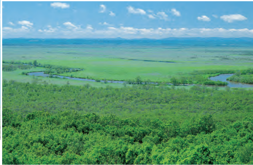
Kushiro River, flowing through the wetlands (Kushiroshitsugen NP) (4)