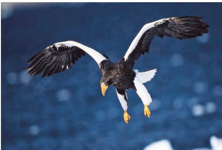
A messenger of winter: the Steller's sea eagle (Shiretoko NP) (4)