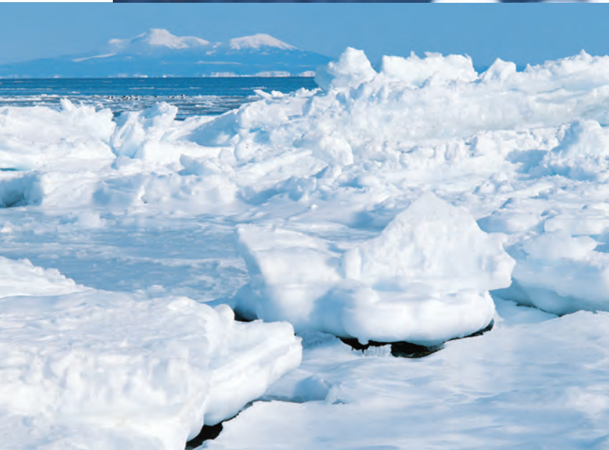
Surging ice floe, with Kunashiri Island in the distance (Shiretoko NP) (5)