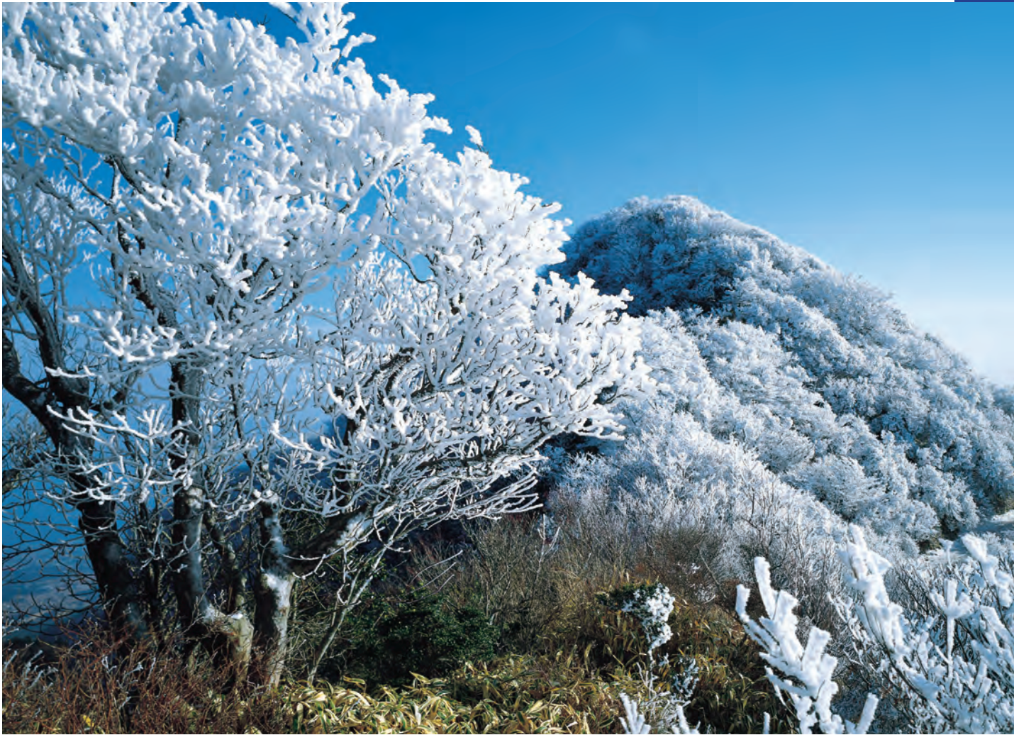
Hoar frost covered trees on Mt. Unzen-myoken-dake (Unzen-Amakusa NP) (3)