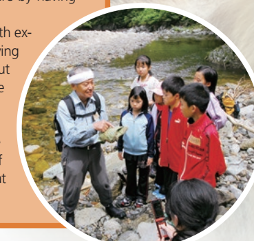
Learning wisdom of Matagi

With the programs, the children go out into nature together with experts of the rivers and mountains who have actually lived by receiving the bounty of nature in Shirakami-Sanchi. The kids hear talks about the traditional dietary culture and hunting from Matagi , Japanese traditional game hunter, and are taught knowledge on fishing from river fishermen. Programs are also held for children to learn about the wonders of nature together with rangers from the Ministry of the Environment through forest patrols and surveys of living creatures. Environmental education is promoted in a way that uses Shirakami-Sanchi as living teaching materials.