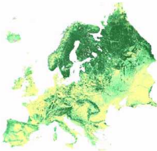
FIG. 3.34. Forest map of Europe. The darkest colour, green, indicates a proportion of 88% forest in the area, while yellow indicates less than 10% [3.69].

Figure 3.34 shows the wide distribution of forests across the European continent. Following the Chernobyl accident, substantial radioactive contamination of forests occurred in Belarus, the Russian Federation and Ukraine, and in countries beyond the borders of the former USSR, notably Finland, Sweden and Austria (see Fig. 3.5). The degree of forest contamination with ^{137}\text{Cs} in these countries ranged from >10 \text{ MBq/m}^2 in some locations to between 10 and 50 \text{ kBq/m}^2 , the latter range being typical of ^{137}\text{Cs} deposition in several countries of western Europe.